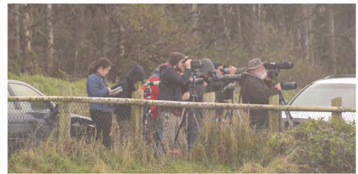
November Central Oregon Coast Birding Trip

Northern Fulmar on 2017 Bird Nerds Pelagic Trip