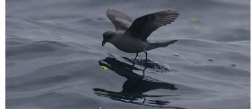
Fork-tailed Storm-Petrel