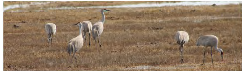
Greater Sandhill Cranes