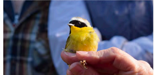
Common Yellowthroat -- by Mamo Waianuhea