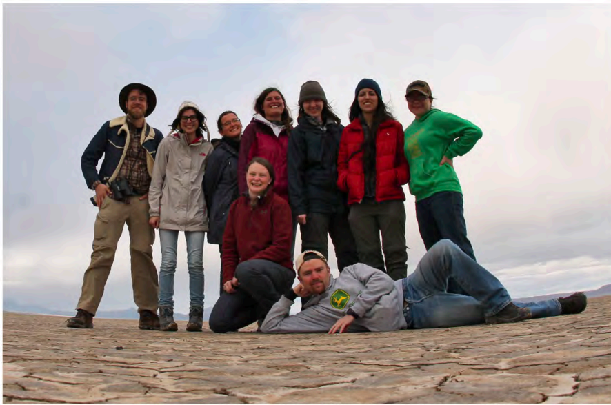
Bird Nerds at the Alvord Desert in SE Oregon during our 2017 Spring Field Trip