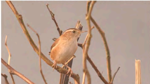
Above left: Bewick's Wren