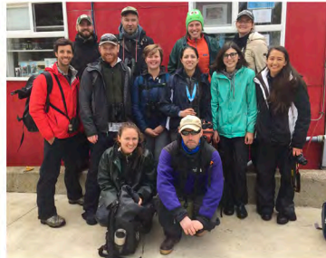
Above right: Pelagic Trip Petroglyph Lake