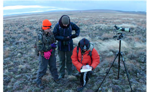
Undergraduates monitoring Greater Sage-Grouse leks during our 2017 Spring Field Trip