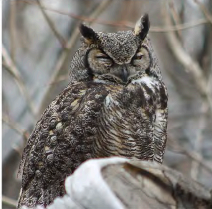
Above left: Great Horned Owl during our 2017 Spring Field Trip