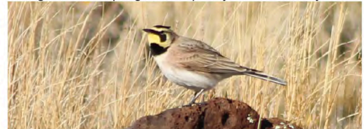
Above: Horned Lark at Hart Mtn. NAR Below: Tree Climbing Workshop Participants