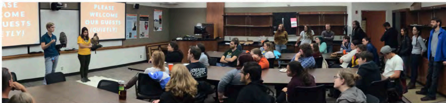
Chintimini Wildlife Center Raptor Ambassadors at our first meeting of the academic year